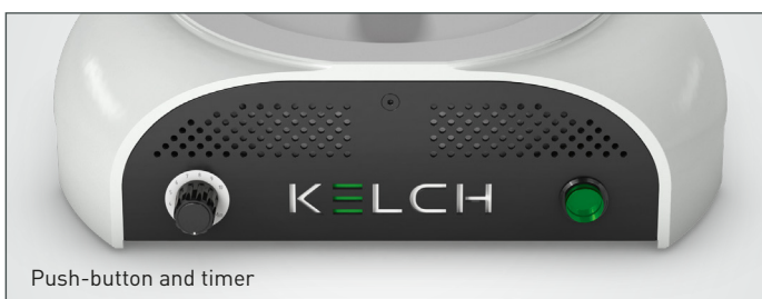
Push-button and timer