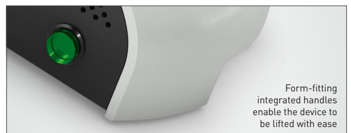
Form-fitting integrated handles enable the device to be lifted with ease